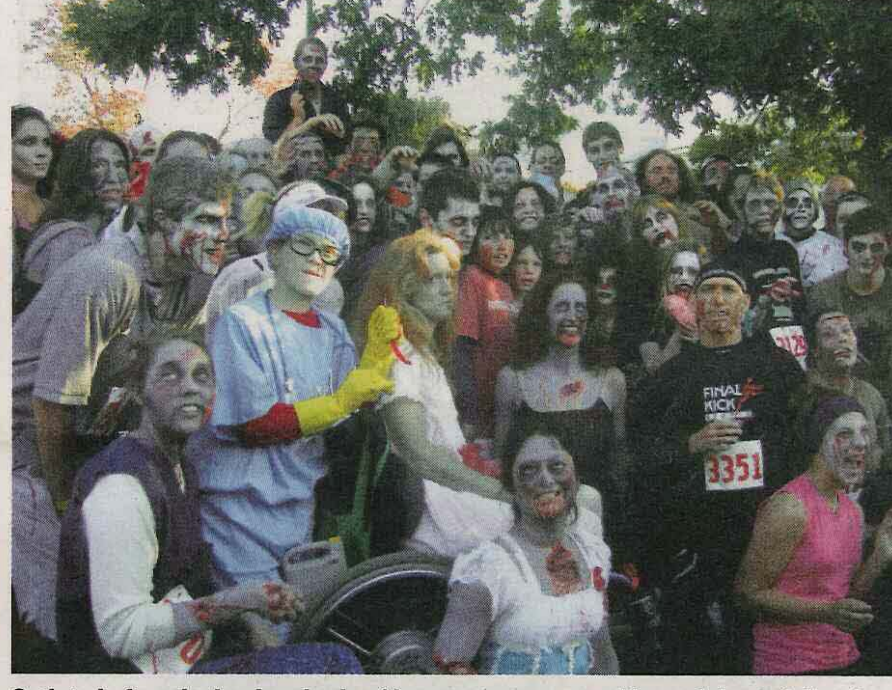
Satiated after slaying hundreds of human runners, zombies celebrate following the first Zombie 5K.